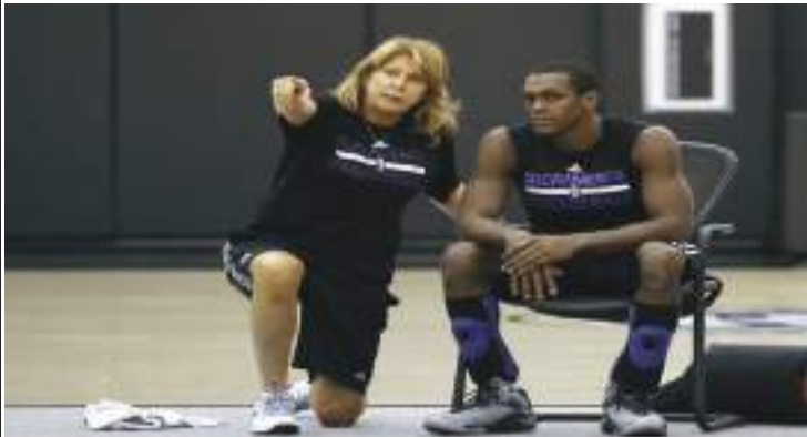
Nancy Lieberman to coach team in BIG3 league