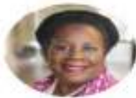
CONGRESSWOMAN SHEILA JACKSON LEE