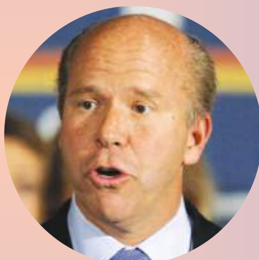
John Delaney Democrat