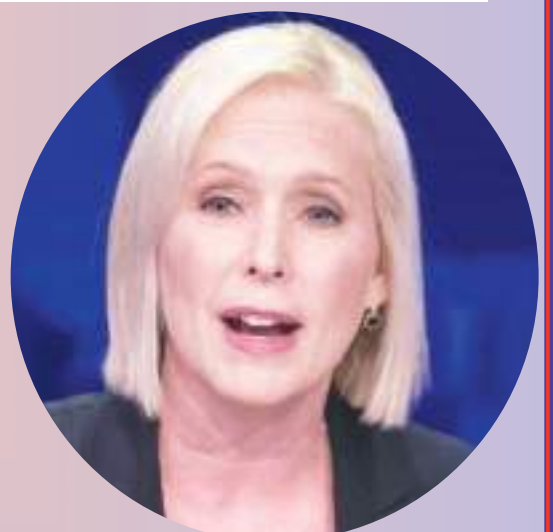
Kirsten Gillibrand Democrat