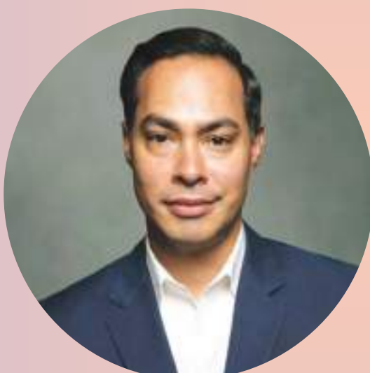
Julian Castro Democrat