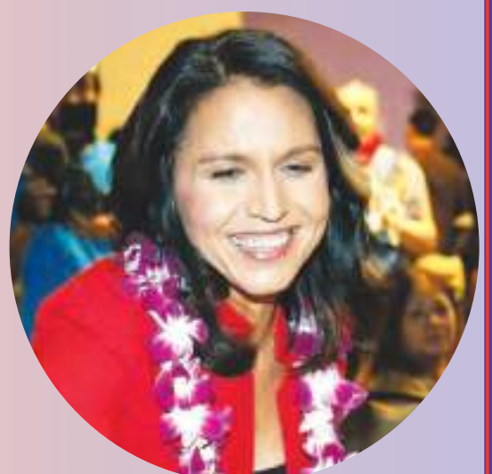
Tulsi Gabbard Democrat