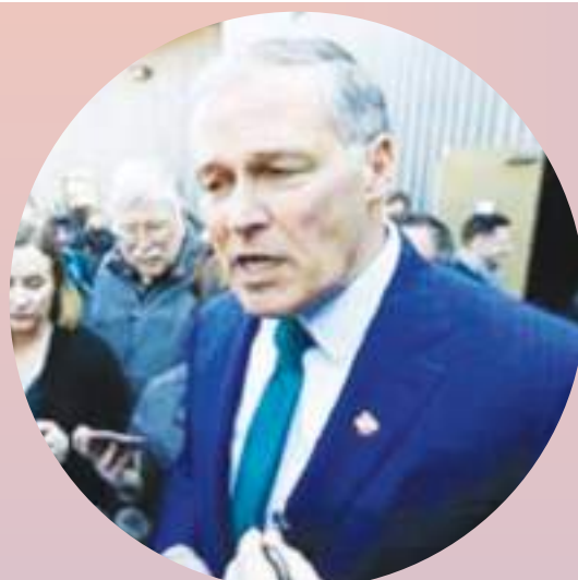
Jay Inslee Democrat