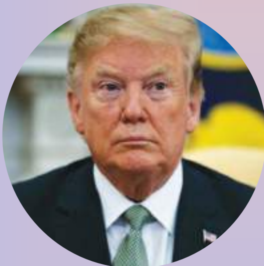
Donald Trump Republican