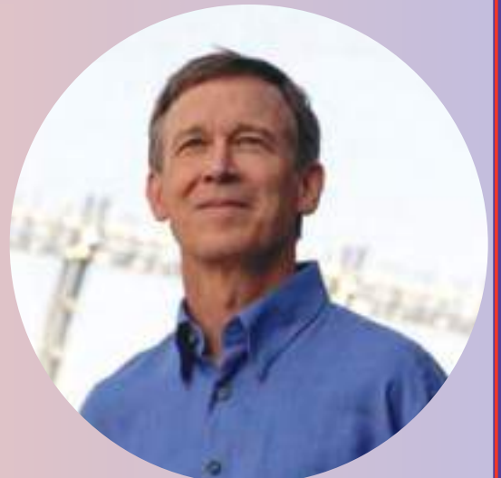
John Hickenlooper Democrat