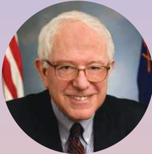
Bernie Sanders Democrat