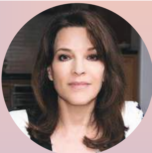
Marianne Williamson Democrat