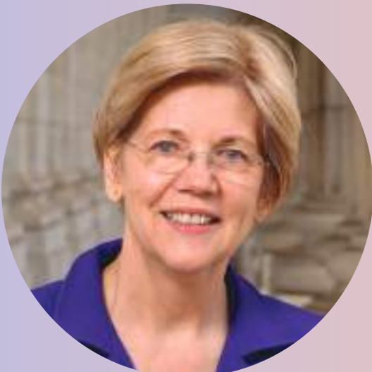
Elizabeth Warren Democrat