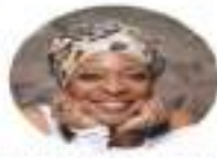
"AUNT YI" FROM THE OWN HIT TELEVISION SERIES QUEEN SUGAR TINA LIFFORD