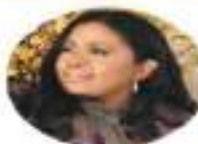
PERFORMANCE BY GOSPEL ARTIST KATHY TAYLOR