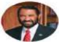
CONGRESSMAN AL GREEN