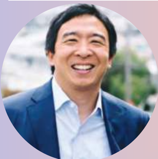
Andrew Yang Democrat