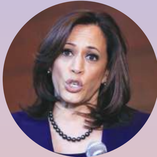
Kamala Harris Democrat