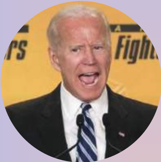
Joe Biden - maybe Democrat