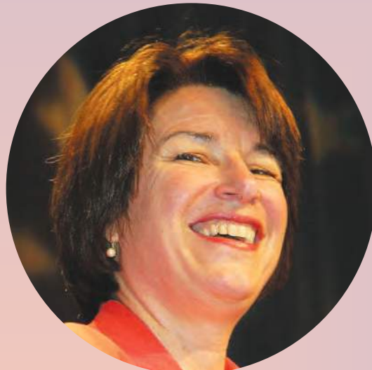
Amy Klobuchar Democrat