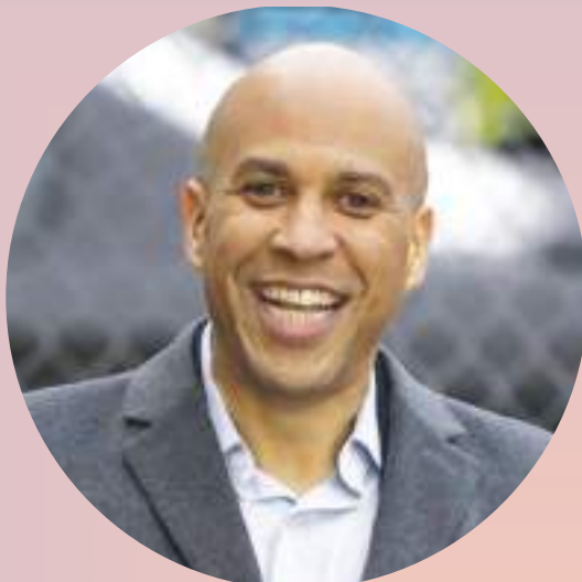
Cory Booker Democrat