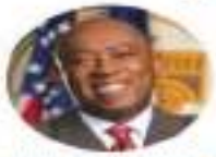
MAYOR OF HOUSTON THE HONORABLE SYLVESTER TURNER