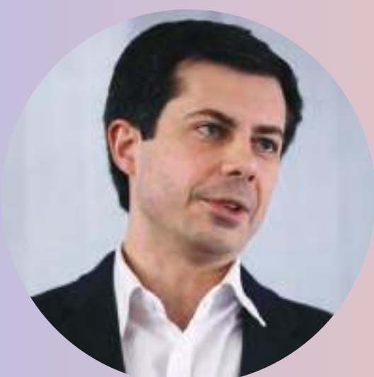
Pete Buttigieg - maybe Democrat