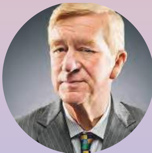
Bill Weld Republican