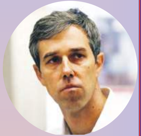
Beto O'Rourke Democrat