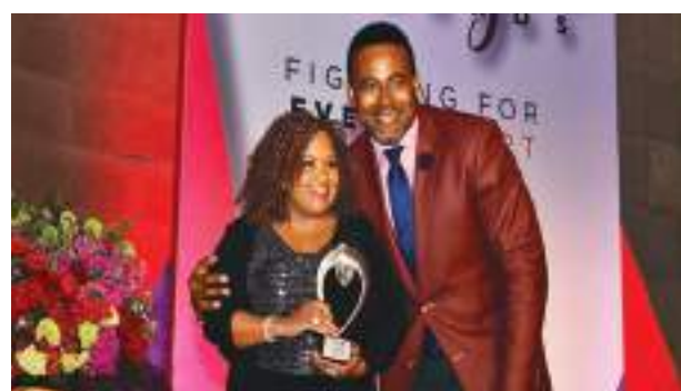
(NNPA) WOMENHEART CELEBRATES HEART DISEASE HEROES, SURVIVORS