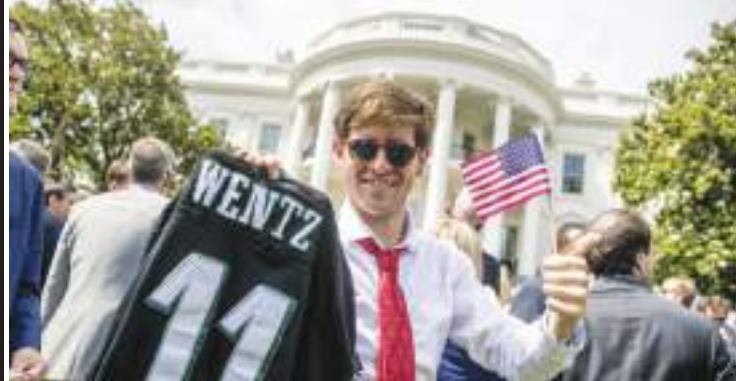
Warriors, Cavs stars say they're not going to White House