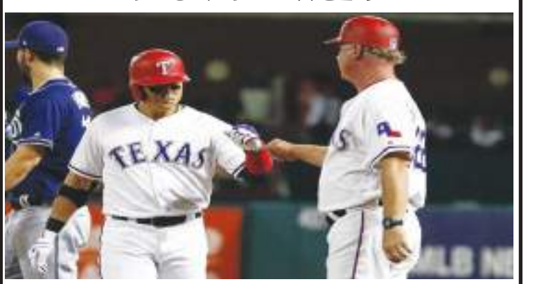
Padres rally past Rangers 3-2