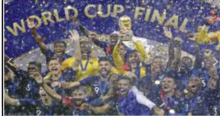
Young, joyful France beats Croatia 4-2 to win 2nd World Cup