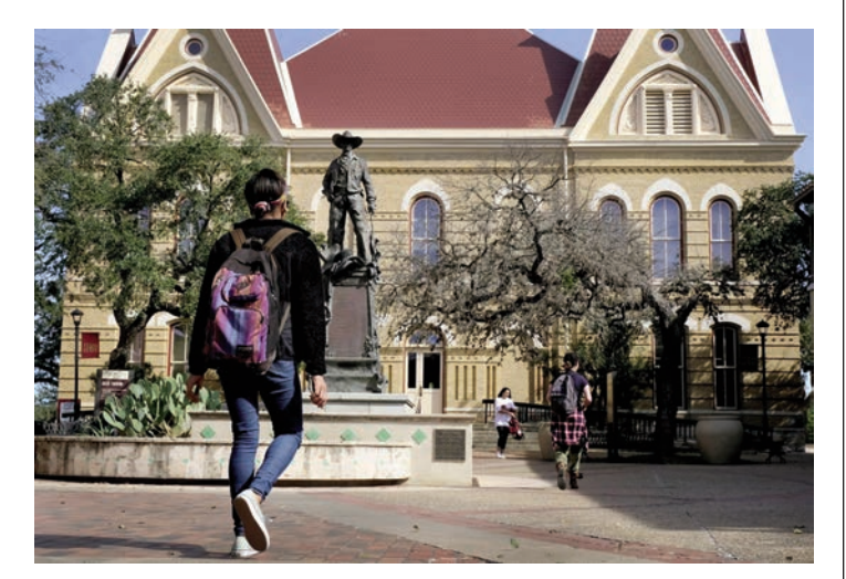
Students walk through Texas State University campus in San Marcos on Jan. 31, 2018.