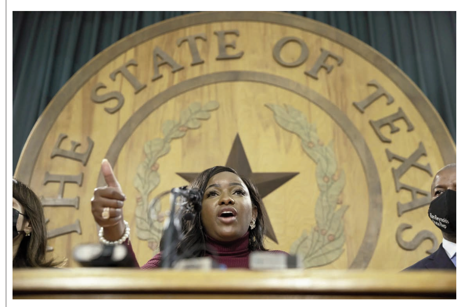
Then-state Rep. Jasmine Crockett, D-Dallas, speaks at a Texas House Progressive Caucus at the Capitol on Sept. 20, 2021.

<link rel="canonical"</pre> href="https://www.texastribune.org/20" 24/01/15/jasmine-crockett-dallascongress/">