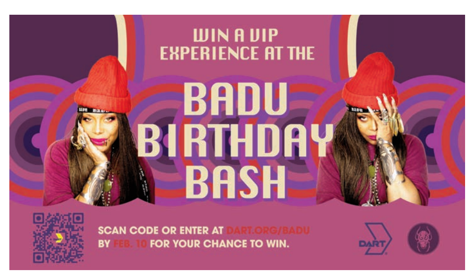
See Badu Page 6