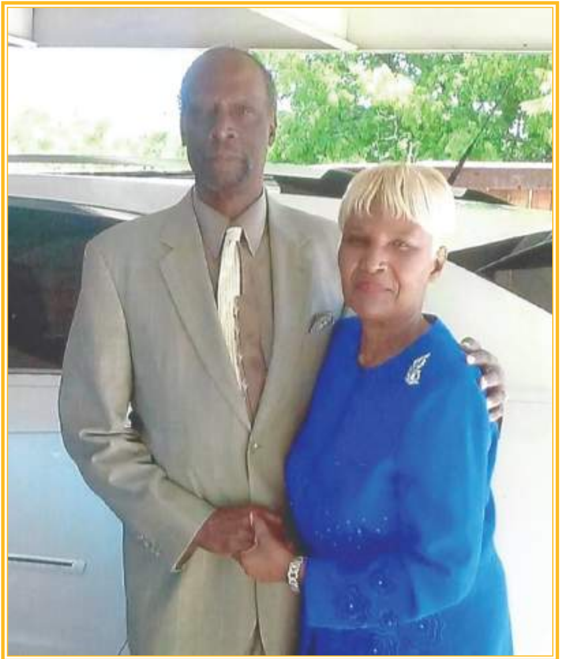
† FIFTY YEARS LATER †

The previous years we have shared will be remembered as a blessing with anticipating more still to come.