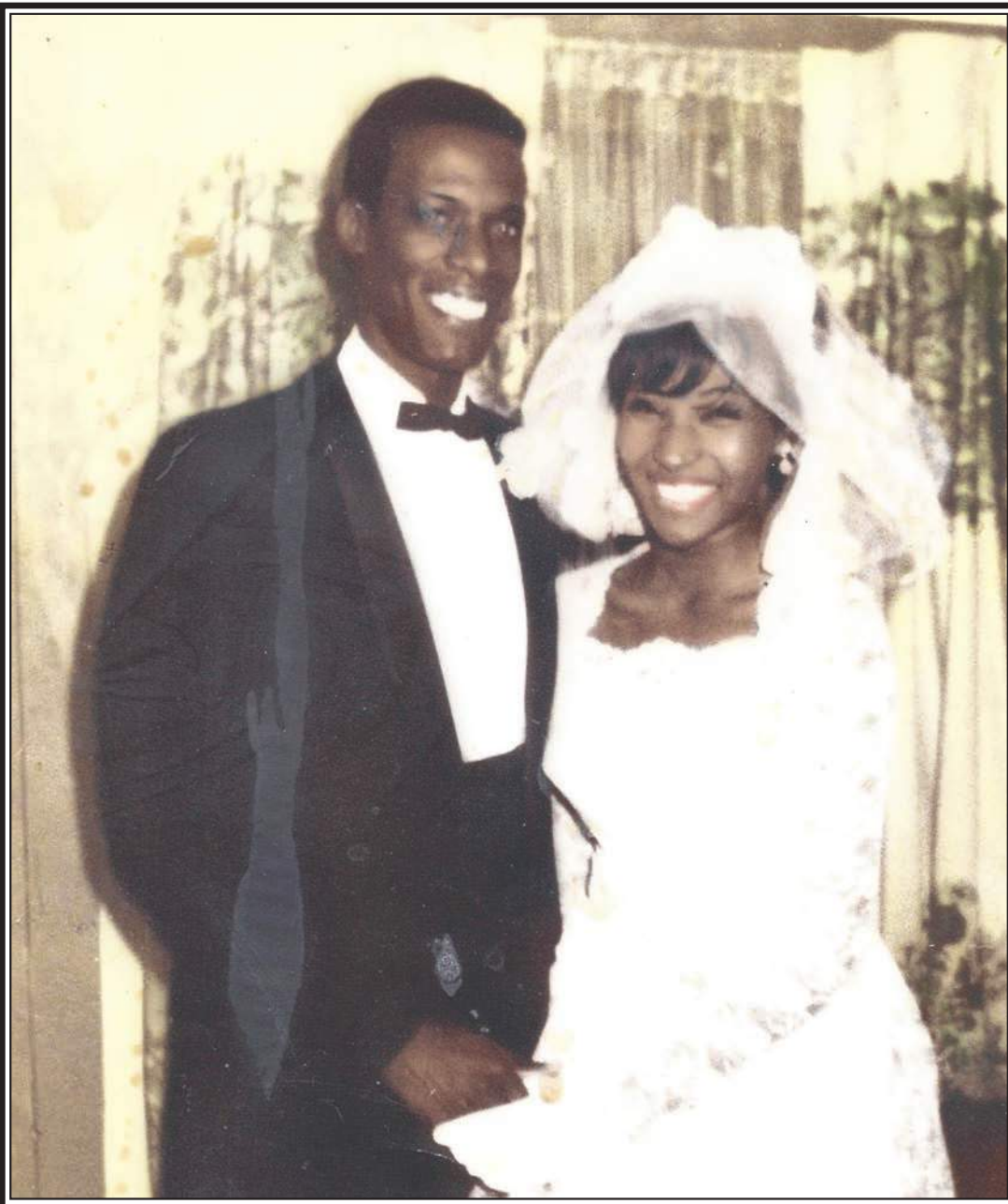
† THAT HAPPY DAY †