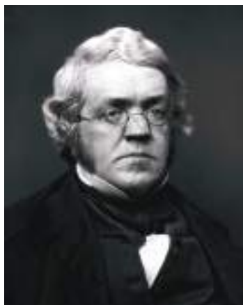
British novelist William Makepeace Thackeray.

women, she may have crafted a different kind of novel.