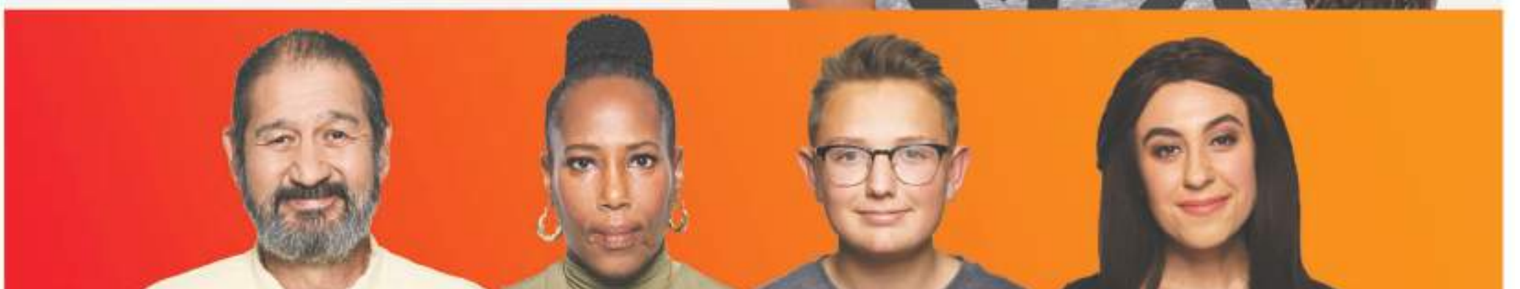
Stand Up To Cancer is a division of the Entertainment Industry Foundation, a 501(c)(3) charitable organization.