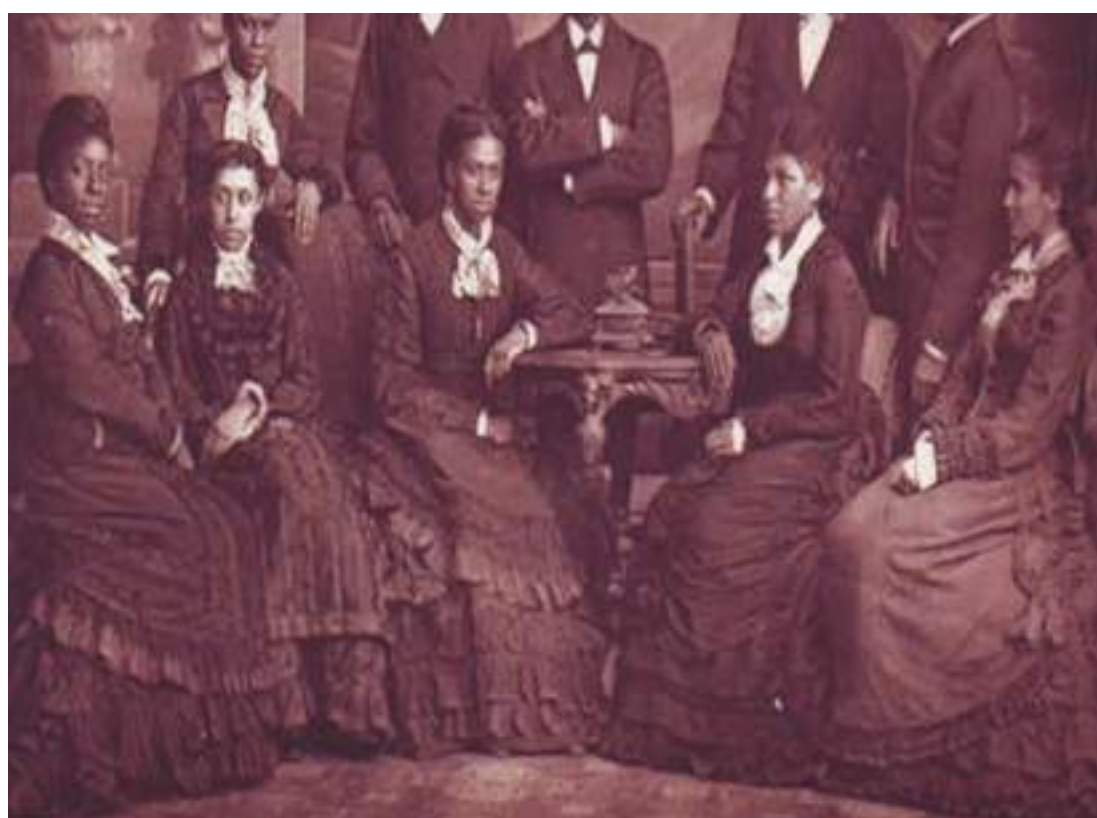
Victorian-era, middle-class black women who loved to read and write didn't have many role models.