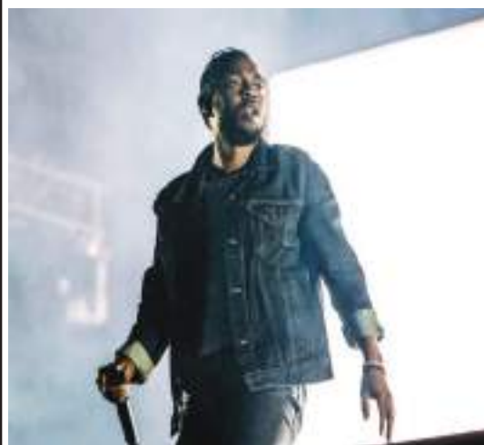
File — In this July 7, 2017, file photo, Kendrick Lamar performs during the Festival d'ete de Quebec in Quebec City, Canada. On Monday, April 16, 2018, Lamar won the Pulitzer Prize for music for his album "Damn."

NEW YORK (AP) — The decision to award rapper Kendrick Lamar the Pulitzer Prize for music represents a historic moment for hip-hop and American music, according to two of the music jurors who picked the album "DAMN." as a finalist.