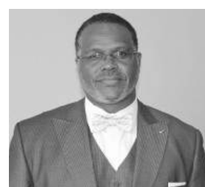
Sammie Berry Minister