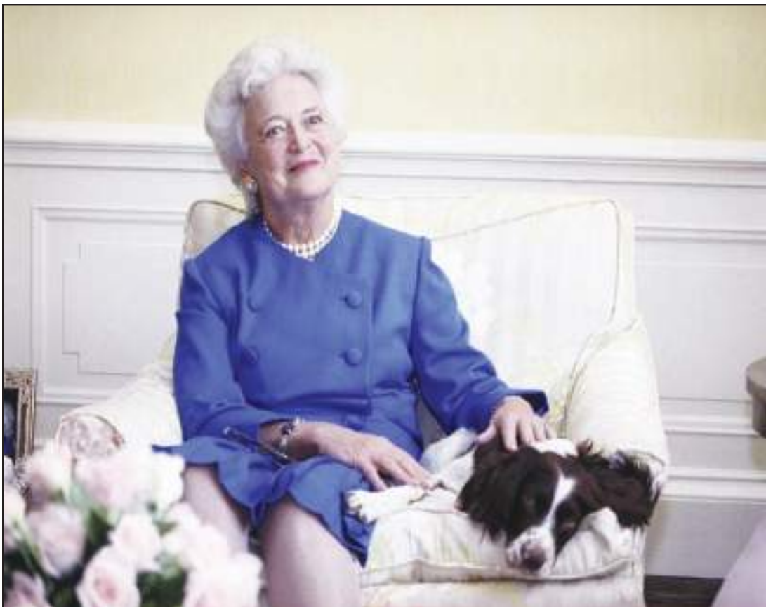
FILE — In this 1990 file photo, first lady Barbara Bush poses with her dog Millie in Washington. A family spokesman said Tuesday, April 17, 2018, that former first lady Barbara Bush has died at the age of 92.

HOUSTON (AP) — Barbara Bush, the snowy-haired first lady whose plainspoken manner and utter lack of pretense made her more popular at times than her husband, President George H.W. Bush, died Tuesday, a family spokesman said. She was 92.