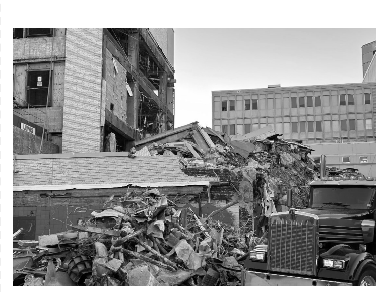
Parkland - Demolition Progress

patients to Parkland. I remember days when all the bays were filled, and the ambulances were two deep," he said. "And seeing parts of the ER going away ... it brought back a lot of memories."