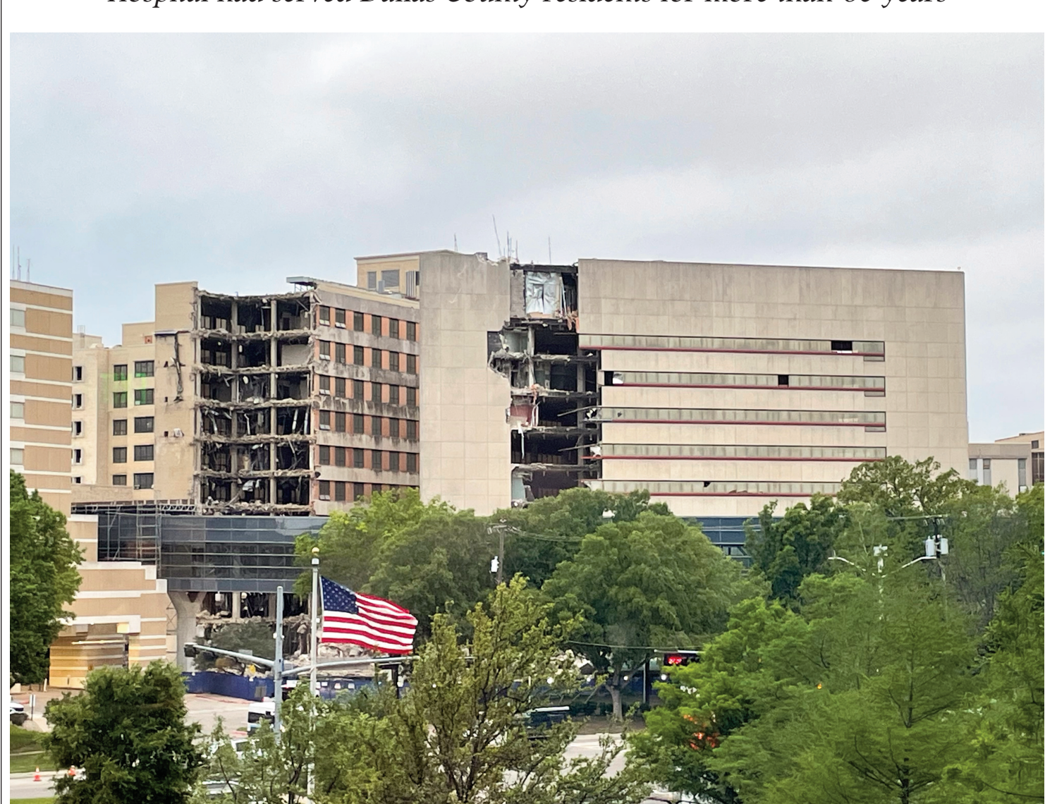
Old Parkland Demolition

Hospital had served Dallas County residents for more than 60 years