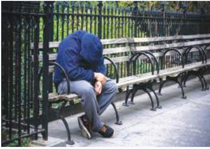
A homeless person in New York.

At a time when millions in the U.S. are poor and disenfranchised, the Poor People's campaign remains as relevant for the U.S. as it was 50 years ago. Consider the evidence: