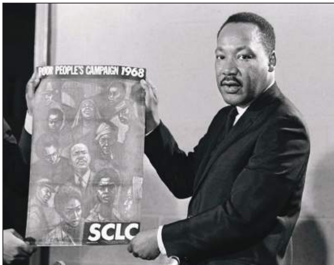
Dr. Martin Luther King Jr. displays the poster to be used during his Poor People's Campaign in 1968.