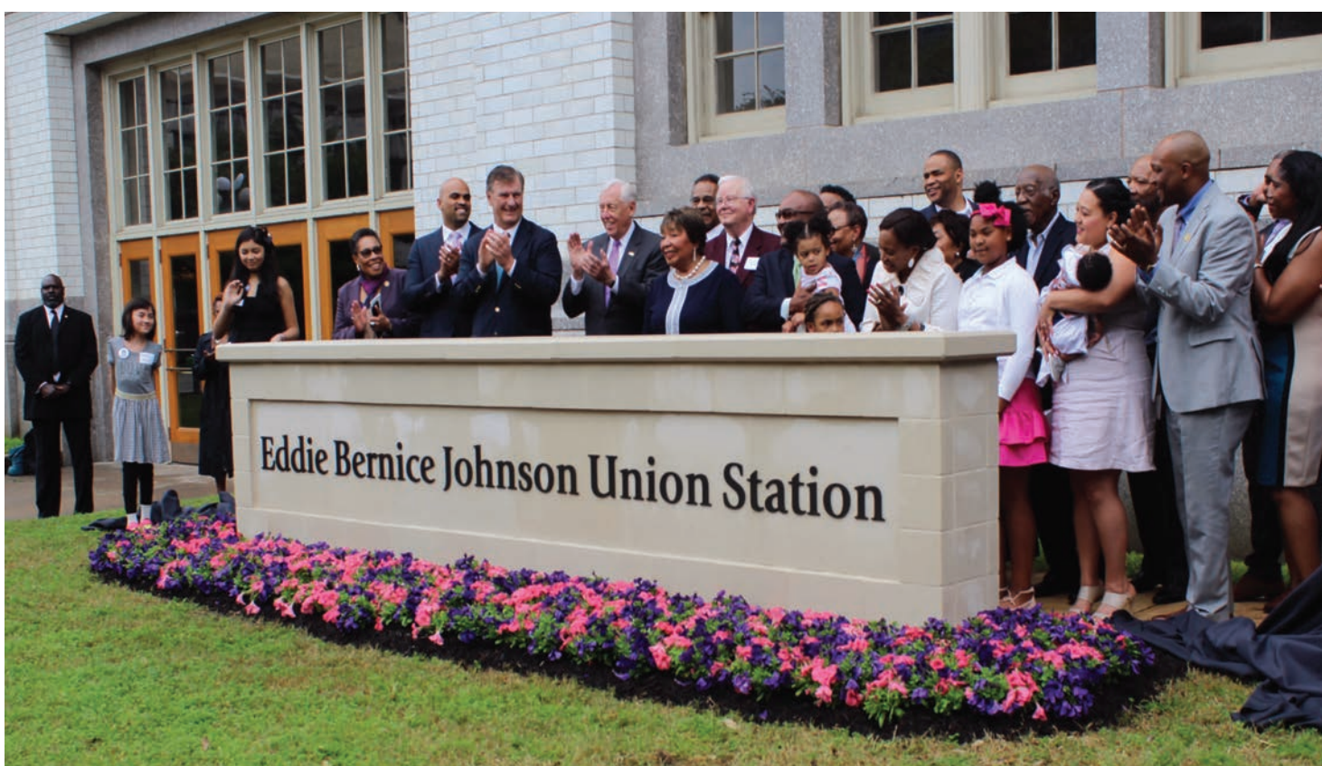
Congresswoman Eddie Bernice Johnson joined by members of her family and Congressional colleagues at the unveiling of the Eddie Bernice Johnson Union Station sign following the facility’s dedication on Saturday, April 6.