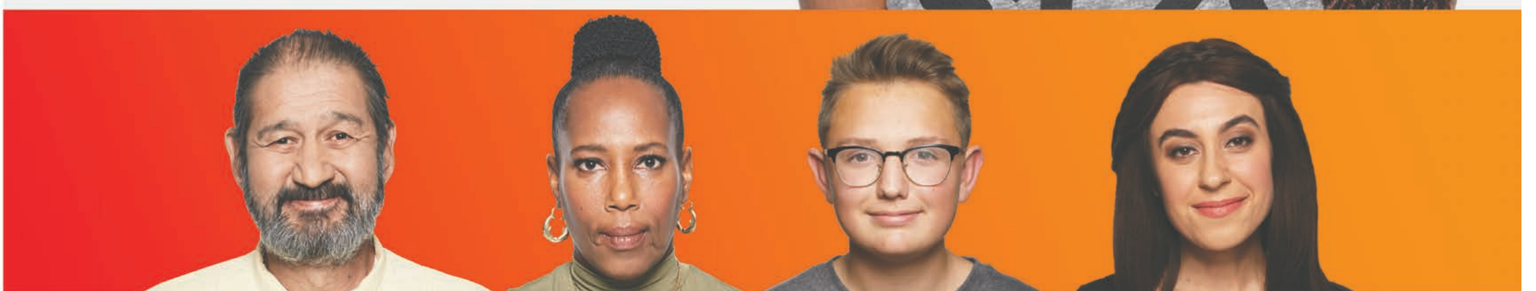
Stand Up To Cancer is a division of the Entertainment Industry Foundation, a 501(c)(3) charitable organization.