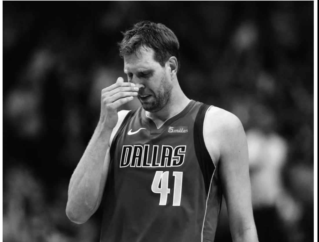
Dallas Mavericks forward Dirk Nowitzki gets emotional after a video played during a break in the first half of the team's NBA basketball game against the Phoenix Suns in Dallas on Tuesday, April 9, 2019.

If you have sports information that you would like placed in the DALLAS POST TRIBUNE Sports Section e-mail us at: production@dallasposttrib.net